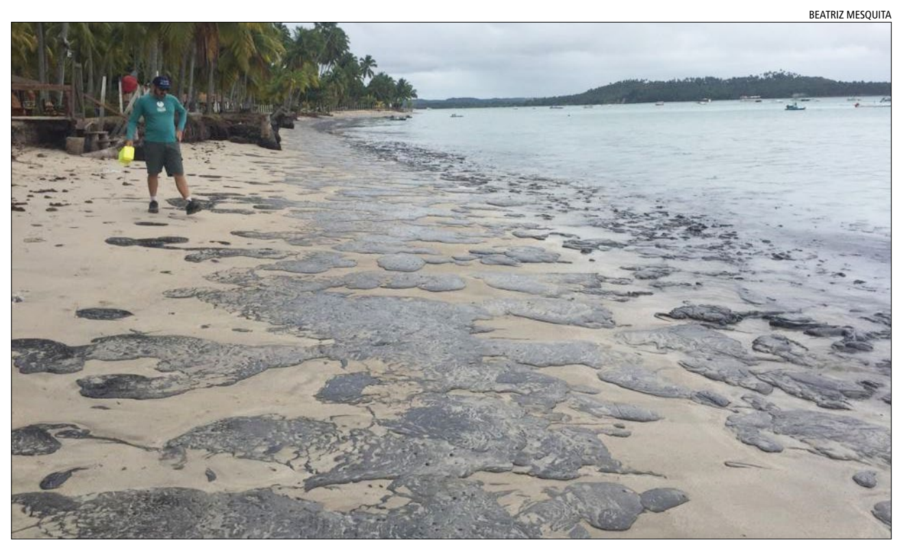
Oil on a beach in the Brazil Northeast, October 2019. Most of this removal was possible thanks to the action of civil society volunteers—fishers, local communities and non-governmental organizations—along with city halls and government environmental agencies

isolation hit the tourism sector that is intrinsically linked with beaches and seafood in this coastal region of the northeast. This further affected the income of families dependent on fisheries.