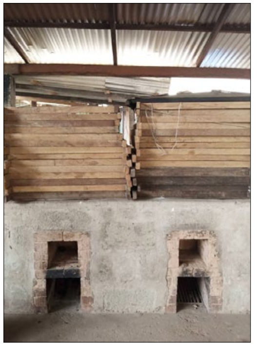
The ahotor oven is energy efficient and helps women fish processors reduce the quantity of firewood in smoking fish. It also improves quality of smoked fish

Project (SFMP) to improve on the quality and competitiveness of smoked fish through the use of a clean smoking technology. The ahotor oven is designed as an improvement over the existing chorkor smoker.