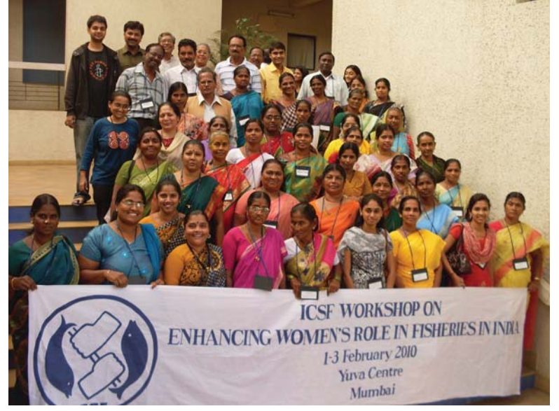
55 participants, mostly women, at the ICSF workshop on "Enhancing Women's Role in Fisheries in India"

about 20 organizations and unions, from all nine coastal States/Union Territories, namely, Andhra Pradesh, Goa, Gujarat, Karnataka, Kerala, Maharashtra, Orissa, Tamil Nadu and West Bengal. The participants ranged from women directly engaged in processing, vending and trading fish, organized into associations, unions, co-operatives, societies, self-help groups and so on, to representatives of support non-governmental organizations (NGOs). Handling the language diversity of the group was a challenge, since as many as nine spoken languages could be heard at the workshop. However, a dedicated set of volunteer interpreters eased communication.