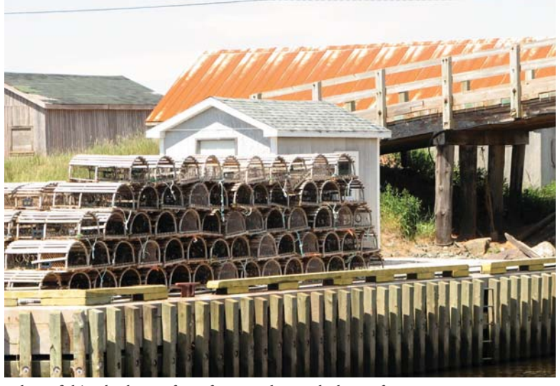
Lobster fishing harbour of Naufrage on the north shore of Prince Edward Island, Canada. Herring is used as bait for lobster fishing

Trouble began brewing in the herring fishery in Souris in 2000 when large herring seiners came to fish in PEI's waters for the first time in about 30 years. Up until 2000, the herring seiners fished their entire annual quota, allotted by the Department of Fisheries and Oceans Canada (DFO), in the Bay of Chaleur, Northern New Brunswick. But concern about overfishing local stocks led DFO to limit the seiners' catch in the Bay of Chaleur to 50 per cent of their quota, and this pushed the seiners out in search of new fishing grounds. When they needed to fill half of their quota outside the Bay of Chaleur, seiners followed these migrating herring to the fishing grounds on the northeast shore of PEI.