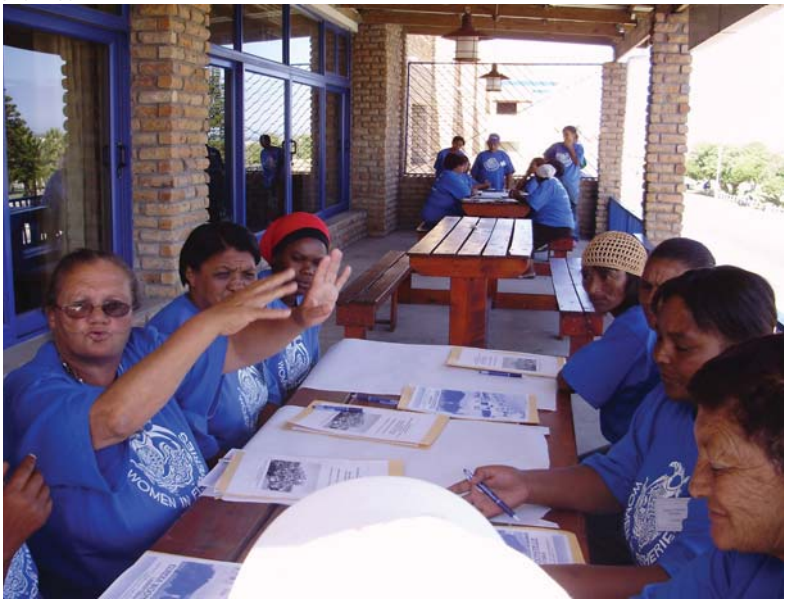
Women actively discussing various issues during the workshop. Women shared their "herstories" of years of working in fisheries

of activism, fighting for fishers' rights in the new policy processes in South Africa, standing side by side with their male partners, challenging the marginalization of the small-scale sector within the current model of fisheries production and economic development in coastal villages and towns.