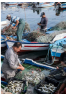
Small-scale fishermen at work in the port of Zarzis, Tunisia