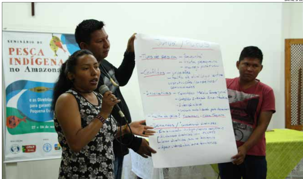
Presentation of the results of the working group of Purus River and Juruá River who believe that these (SSF Guidelines) can strengthen their reserves, through dialogue with prefectures, other governmental organizations, and also with NGOs

counterpart Secretary of Aquaculture and Fisheries said she would take the results of the seminar back to Brasilia where it would be discussed with her superiors in the context of fisheries policies for North Brazil. Participants expressed their desire for the conduct of other seminars to disseminate the SSF Guidelines. They also delineated a list of villages interested in fisheries management and family aquaculture. They highlighted the need for greater participation of women in events and issues related to fisheries in the region. They also expressed their desire to connect with international indigenous movements to discuss the SSF Guidelines.