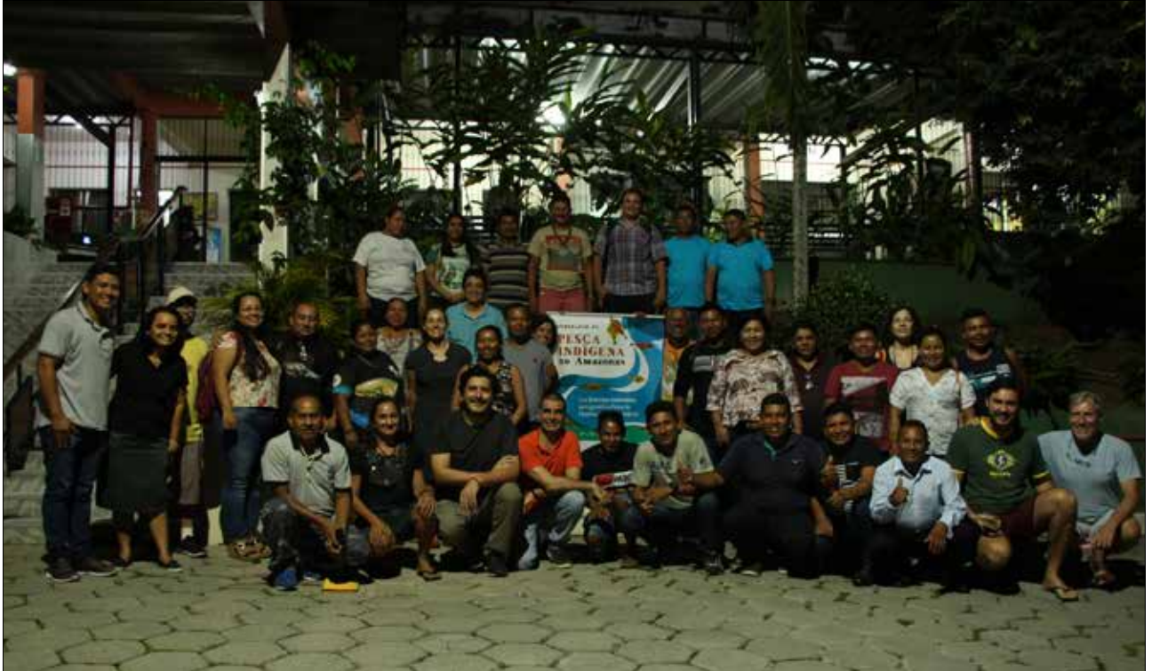
Indigenous peoples of several Amazon regions came together in Manaus in Brazil during 27 to 28 March 2019 to learn about small-scale fisheries policies at a seminar on 'Indigenous Fishers in Amazon State and the SSF Guidelines'