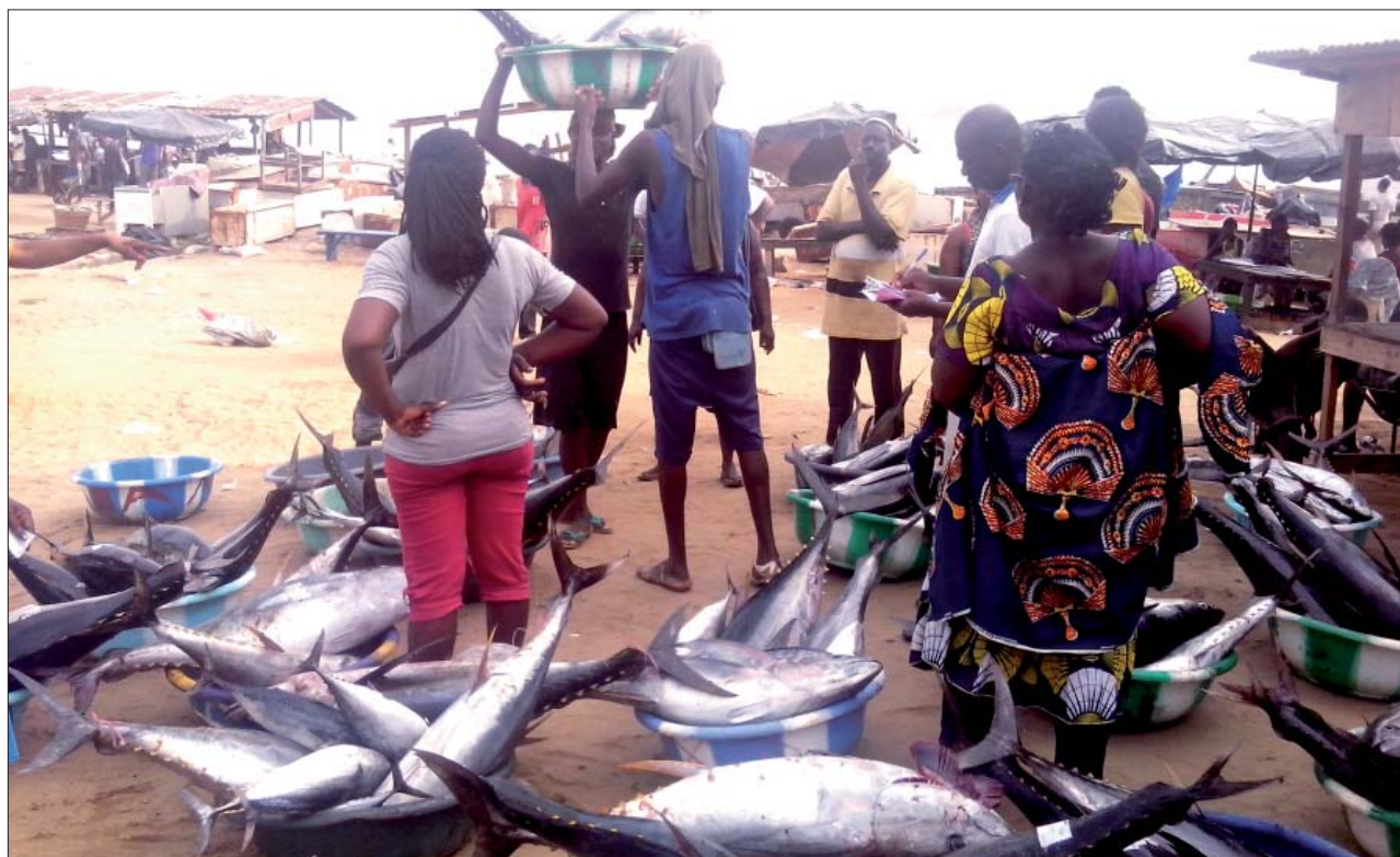
Faux thon trade in Abidjan, Côte d'Ivoire. Today, this faux thon is landed in Abidjan by the tuna boats' crew, and sold without control to local intermediaries, who then sell it to the women