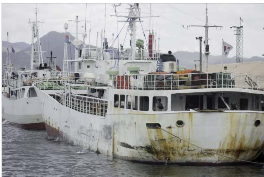
Fishing vessels at Suva harbour, Fiji. The wages of primarily unskilled workers remain constant, and they are often in debt