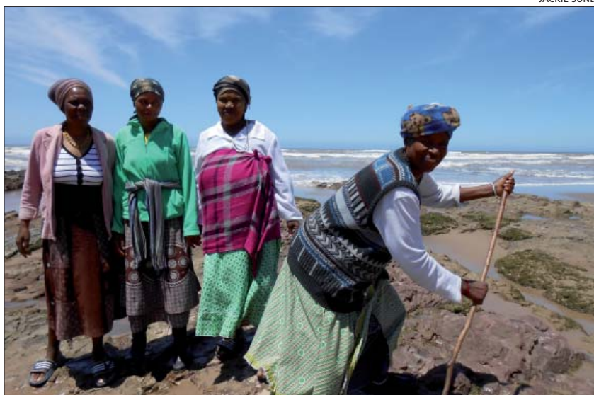
Net fishers at the Langebaan MPA. The 23 MPAs along the coast comprise a total of 23.17 per cent of South Africa's coastline

The ICSF research highlights that there is a subtle but significant gap between policy and actual practice. It appears that it is this gap that results in small-scale fishing