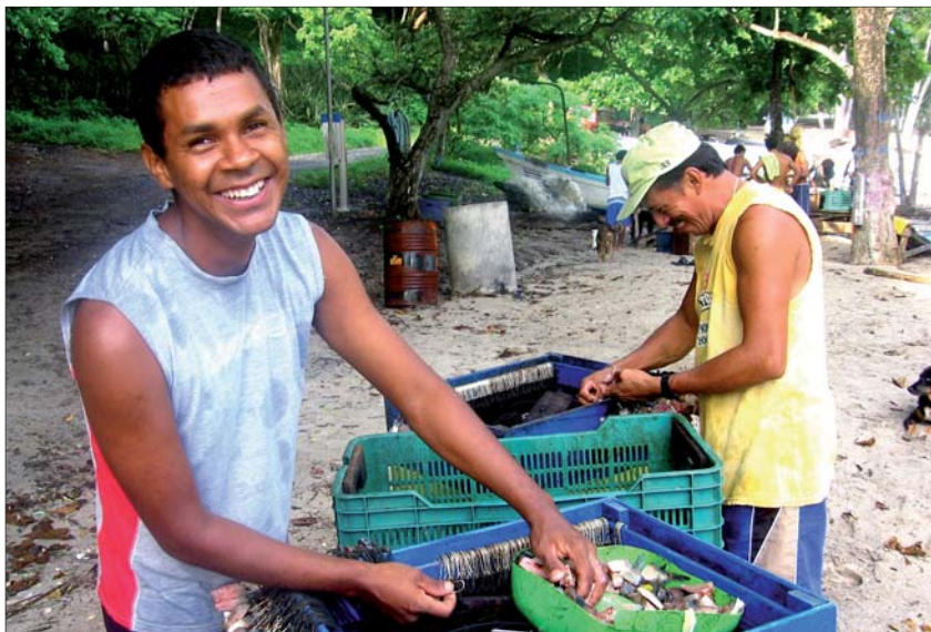
A fisherman in San Juanillo Bay getting ready to set out on a fishing trip. The San Juanillo community is fighting against the construction of a marina in the area

The anti-marina campaign by the San Juanillo community involved a great degree of communication and exchange of information with other coastal communities in Costa Rica, like Tarcoles on the Pacific coast, who had experienced similar development projects near their homes, which affected their traditional fishing grounds. Field visits and sharing of real-life experiences revealed the realities behind this kind of investment in 'development', which offers few