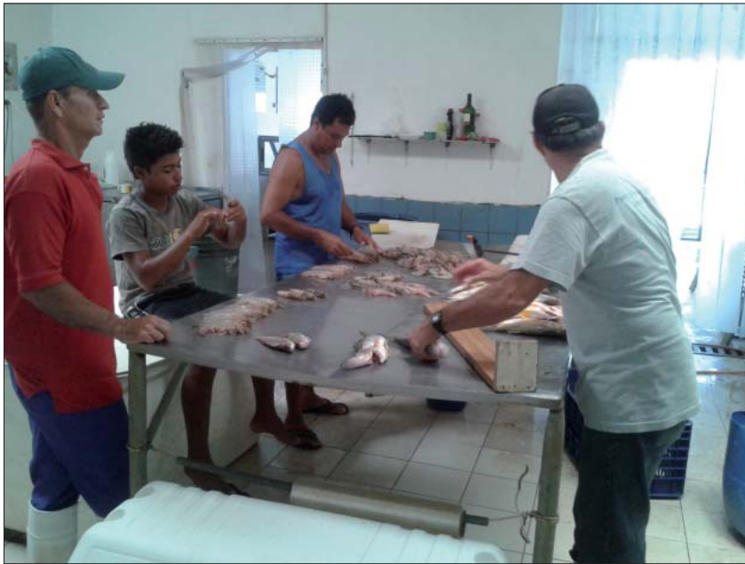
Small-scale fishers from the Tárcoles community in Costa Rica. With over seven years of experience, these fishers have been able to manage their resources well

collective environmental right. If the former threatens the conservation or sustainability of the latter, the political constitution protects the environmental right, because of irreparable damage done to the environment.