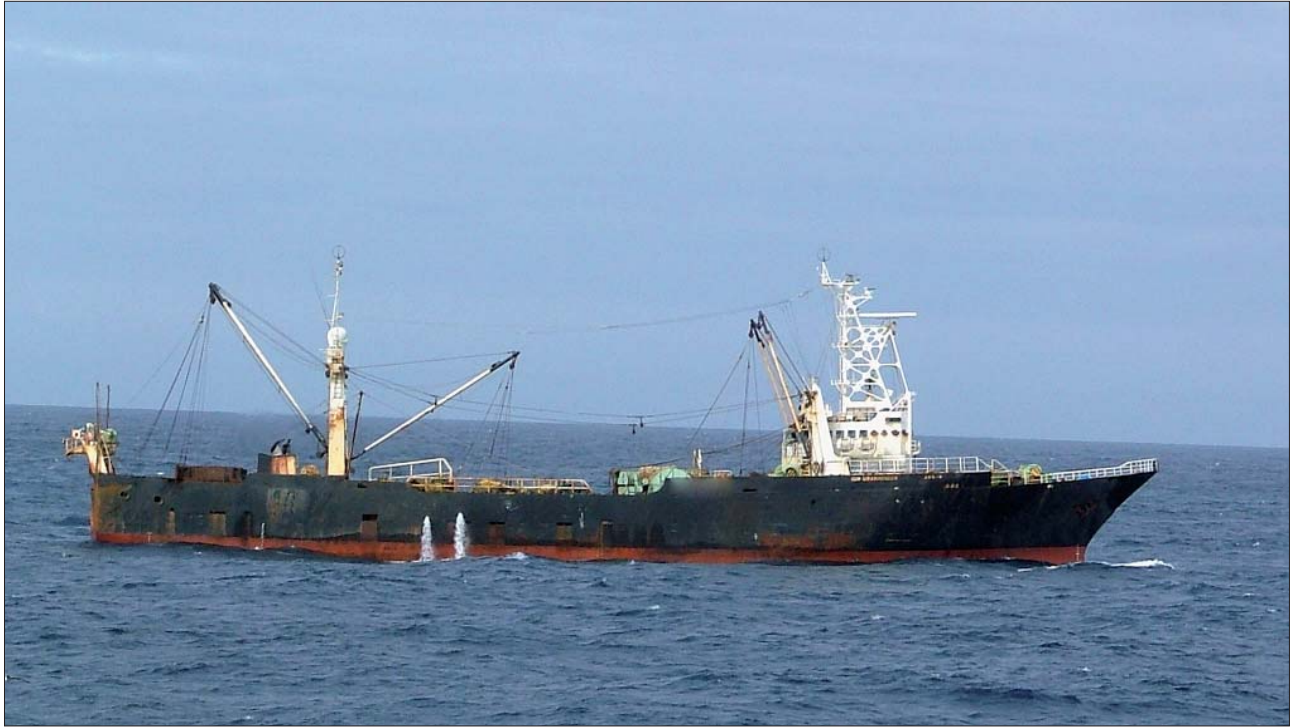
A South Korean vessel fishing in New Zealand's waters. Forced labour has been a key element of the country's foreign chartered vessel business model