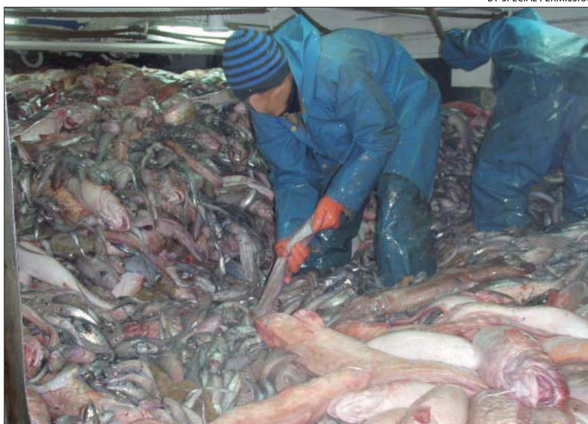
Unwanted fish, on a South Korean fishing vessel, waiting to be discarded. Crew members often dump fish overboard to reduce the amount of processing