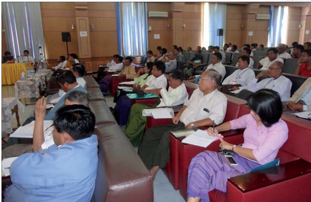
The participants for the three-day workshop included 10 parliamentarians as well as NGOs, the Myanmar Livestock Group and the local FAO Programme Chief