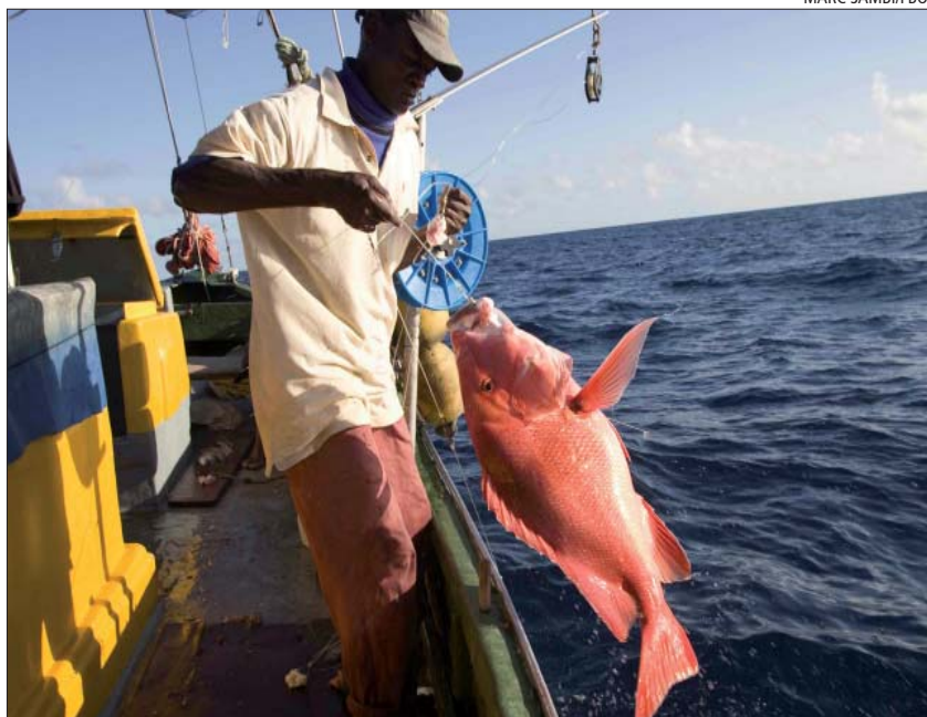
Hook-and-line fishing, selective of both species and size, is the oldest and most widely practised fishing technique in the Seychelles