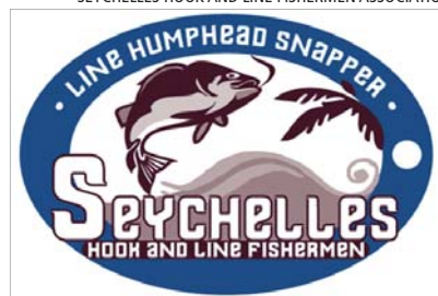
The label will inform the consumer who caught the fish, where and how

SEYCHELLES HOOK AND LINE FISHERMEN ASSOCIATION