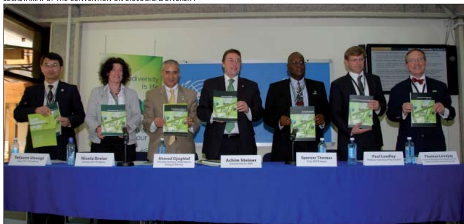
Launch of the third edition of the Global Biodiversity Outlook, at Nairobi, Kenya

sobering statistics on the state of the earth's natural resources. The report suggests that marine and coastal biodiversity continues to decline. Habitats such as mangroves, seagrass beds, salt marshes, shellfish reefs and coral reefs face continuing pressures. It is estimated that 80 per cent of the world's marine fish stocks, for which data is available, are fully or overexploited. Attention is also shifting towards deep-water habitats, although data for these areas is still limited. The GBO-3 report indicates that less than one-fifth of marine ecoregions meet the target of having at least 10 per cent of their area protected by 2012.