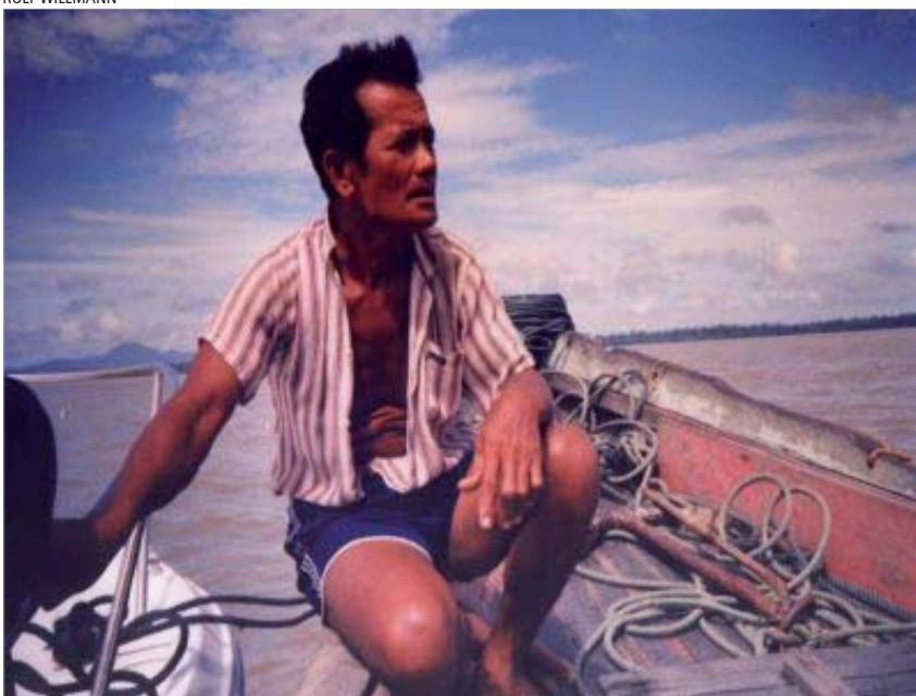
An artisanal fisherman from Sarawak, Malaysia. The BOBLME project will focus on strengthening the management capability in each participating country