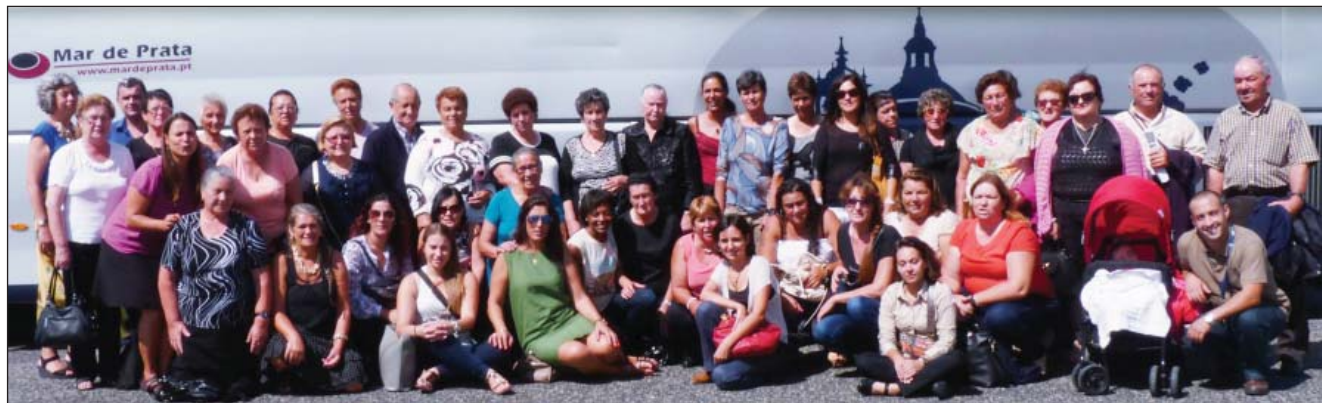
Participants at the national level meeting of Estrela do Mar (Sea Star). Estrela do Mar were able to successfully promote fisherwomen rights within the fisheries sector and their presence was acknowledged in all projects promoted by Mútua dos Pescadores