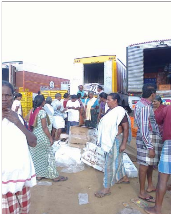
Insulated vans bringing iced and frozen fish to the sea shore in Pallam, Kerala, India

were quite a number and the shore was as busy as ever. Hundreds of women fish vendors buying fish, sorting it, repacking it and taking off in auto-rickshaws (three-wheeled vehicles) to the market.