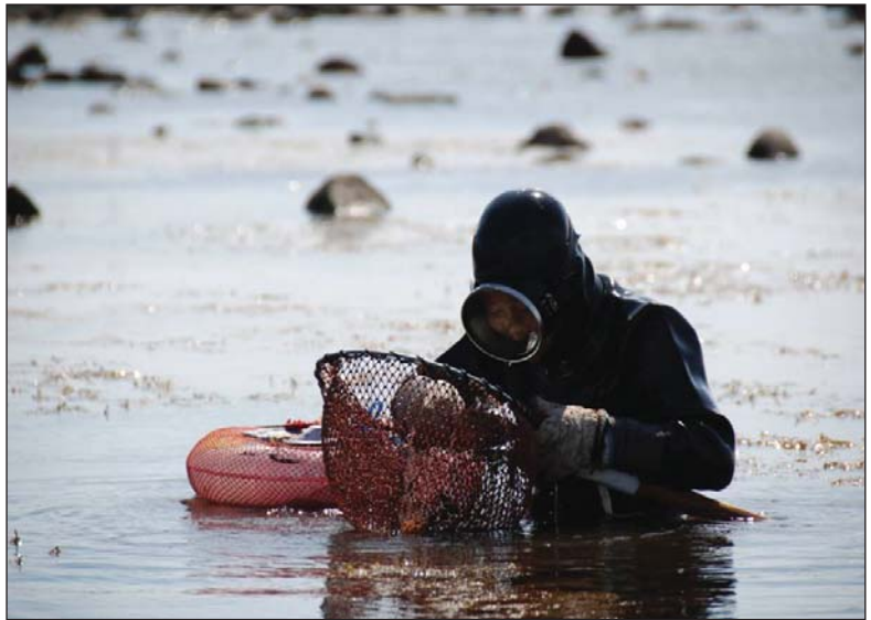
Ama harvest iwanori (rock seaweed) and namako (sea cucumber) in winter. They are the direct descendants of the nomadic sea gypsies from the Korean island of Jeju