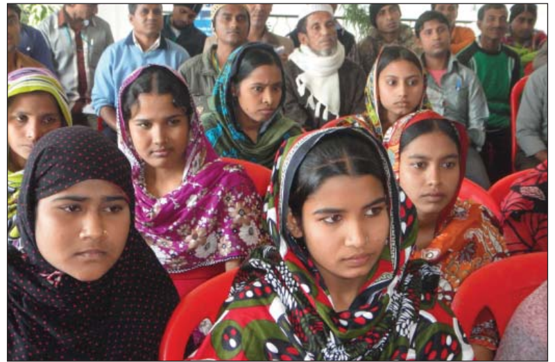
Participants from the shrimp processing industry at the labour laws training programme organized by BEST-BFQ project, Bangladesh