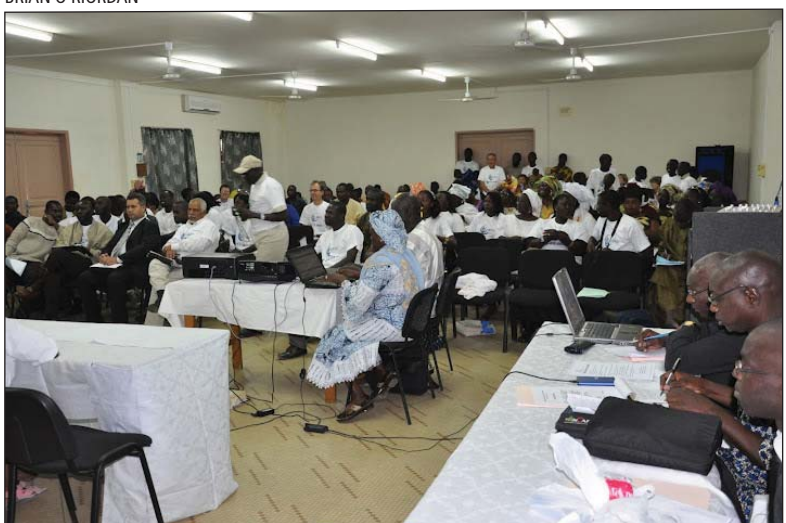
Participants at the Senegal SSF Guidelines Workshop. Women's rights and interests need to be protected in all aspects of small-scale fisheries

such as in urban and tourism areas and aquaculture sites, need to be secured. Titling policies must provide mechanisms to ensure de facto and de jure equality for women. Where rights to fisheries resources, land rights and access to infrastructure are redistributed to achieve a more equitable distribution of resources, specific measures must be put in place to ensure that women benefit equitably. Further, recognition and support for fisher's knowledge, culture, traditions and practices to inform the management of resources should be ensured, recognizing the specific knowledge of women fishers and fishworkers in the process.