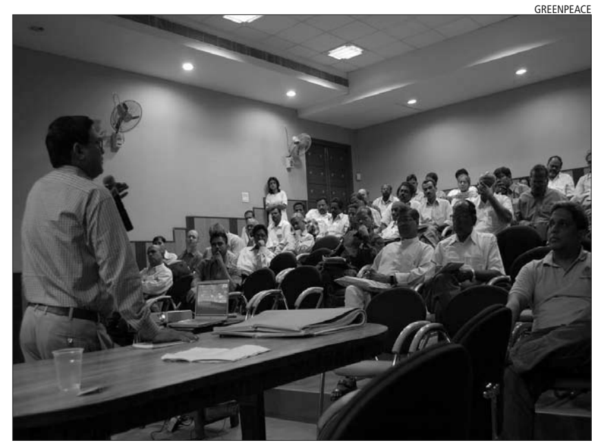
Three-day workshop, between 8 and 10 October 2007, on "Fisheries and Marine Reserves in India" and their relevance

Recognizing that marine ecosystems, in particular, coastal ecosystems, are rich spawning and breeding grounds, and provide vital coastal-protection benefits;