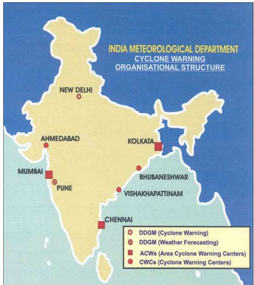
The Cyclone Warning Centres (CWCs) of IMD crowd only the eastern coast, leaving a visible gap on the western side

had often led to false alarms being sent out to rescue agencies, leading to wastage of time and resources. Sensitisation and awareness of fishermen about rescue operations should, therefore, become an integral part of any disaster risk reduction initiative.