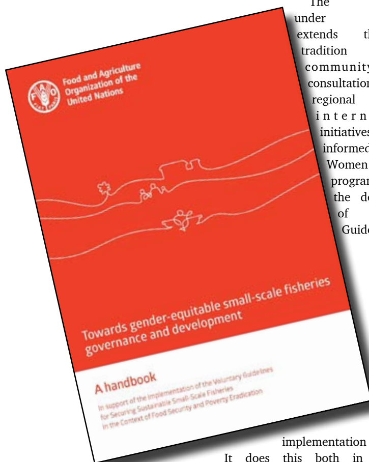
FAO. 2017. Towards gender-equitable small-scale fisheries governance and development - A handbook, by Nilanjana Biswas. Rome, Italy. http://www.fao.org/3/a-i7419e.pdf

and gender issues were largely invisible in fisheries research and particularly in policy throughout the world. Something like the SSF Guidelines, with its attention to women and to gender, was, for me at least, unimaginable.