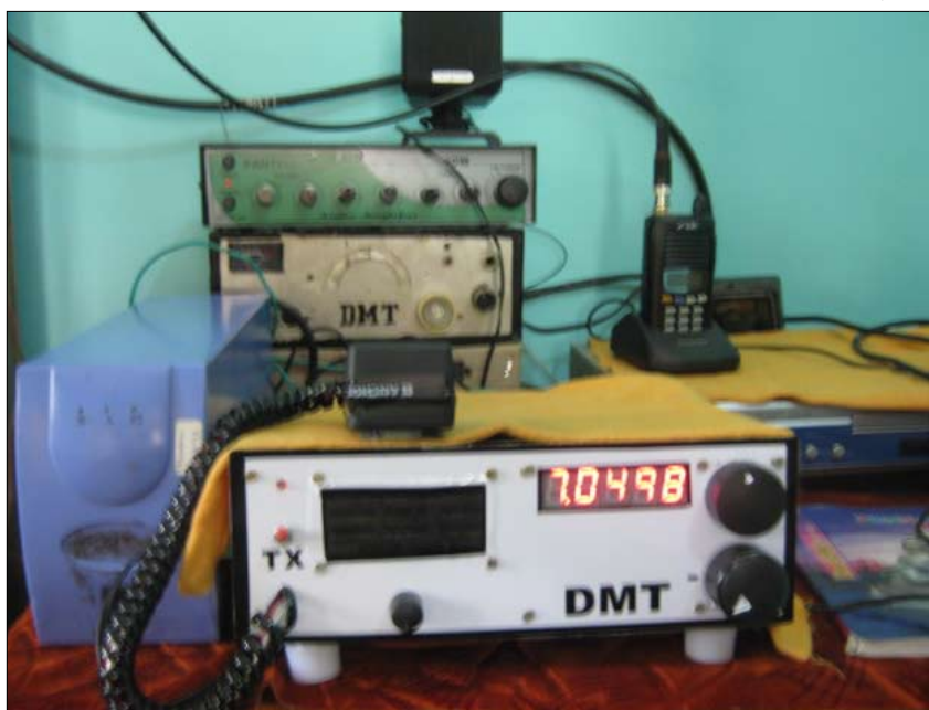
A HAM Radio used in emergency communications is an immensely useful tool for cost-effective dissemination of information

The problems resulting from corrosion of batteries and non-receipt of signals in transistors can be overcome by using battery-less, low-cost hand radios which can receive warning-broadcasts from All India Radio, the national station. Television and radio stations can also utilize the cell broadcast facility via the