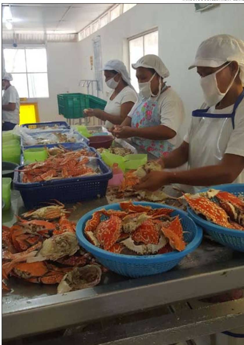
Women workers in a Blue swimming crab meat processing station in Bantayan, Cebu, Philippines. Women's equal rights to development should be recognized and promoted