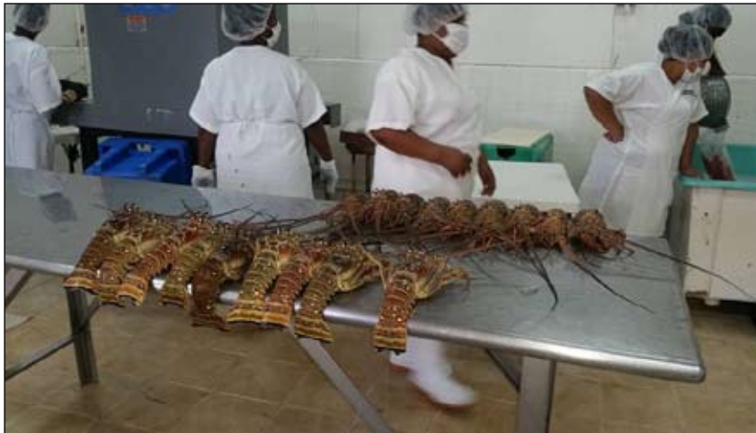
Lobsters in a fishing processing plant in Belize. Local fishers are accustomed to the fisheries regulations such as open and close seasons/size limits for lobster and conch

laws, regulations and policies that affect their well-being.