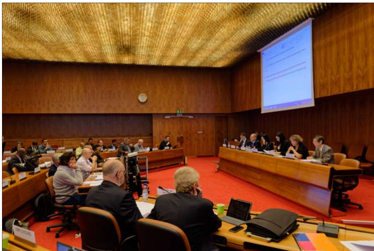
The ILO migrant fisher meeting: Tripartite Meeting on issues relating to Migrant Fishers, 18 - 22 September 2017, Geneva, Switzerland