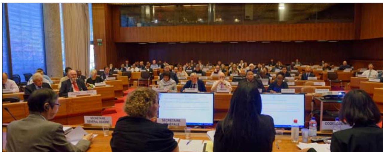
Participants at the ILO migrant fishers tripartite meeting showed, once again, what can be achieved through social dialogue and a willingness to find solutions through co-operation

hard to come by, but the widespread human-rights abuses reported were so unacceptable that the international community could not remain mute on the sidelines. The forced labour of 'modern slavery' manifested as: abuse of vulnerability; deception; restriction of movement; isolation; physical and sexual violence; intimidation and threats; retention of identity documents; withholding of wages; debt bondage; abusive working and living conditions; and excessive overtime.