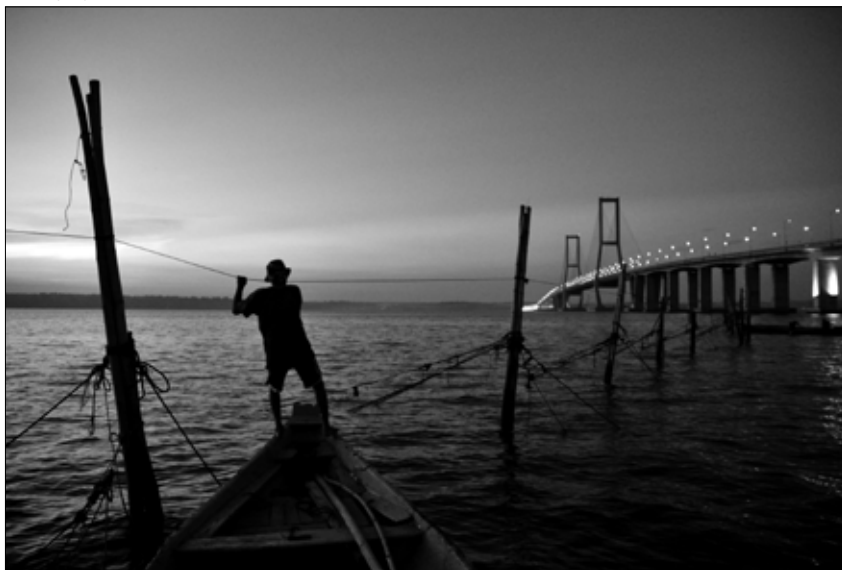
Small-scale fishers are defined as people who earn their livelihood in fishing, without using fishing vessels or using only those vessels under 10 gross tonnes (GT)

Small-scale fisherfolk have to compete for resources with fishing vessels above 10 GT. Slack monitoring, control and surveillance throws open to other parties access to resources. Small-scale fishers have no exclusive rights and their strategic role has not been recognized in terms of sufficient protection of their tenure rights to fishery and land resources.