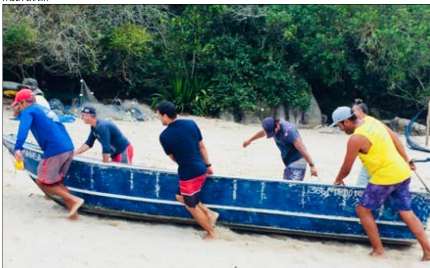
The efforts of ABAT fishermen and boatmen to ensure local access to marine traditional territories and to maintain their livelihoods in a restricted-use protected area are interesting

until 1996, when the boatmen and fishermen created ABAT, aiming to establish collective rules for artisanal fishing and community-based tourism. Fishing is the basis of the Caiçara culture and a fundamental activity for fishermen and boatmen. Of late, boat trips have become a substantial part of the local community members' income, being as, or more, important than fisheries. This tourism activity currently takes place inside the PNSB and nearby localities.