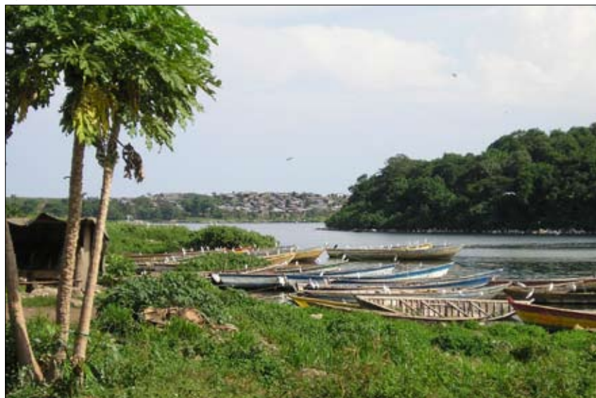
Boats parked up on island landing site. Employment relies upon good relations with the boatowner, as the owner must trust the crew with their boat and gears