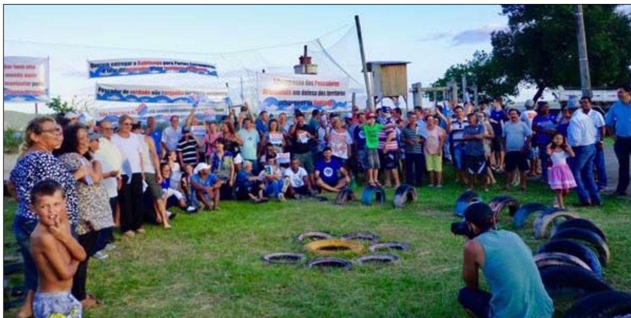
Participants of the first congress of Babitonga Bay artisanal fishers in defense of fishing territories, March, 2016. The event enabled exchange of experiences and planning to come up with a united voice on the protection of fishing tenure rights