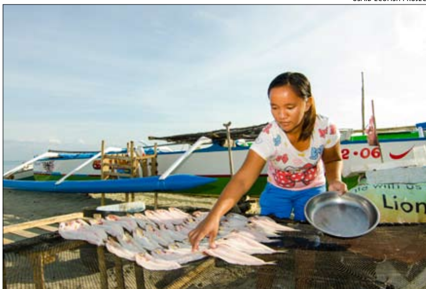
Drying fish to sell in San Fernando, Philippines. Secure community-scale marine resource governance regimes can produce positive social, cultural, economic and ecological outcomes

In addition to sea tenure, there is an urgent need to recognize land tenure for small-scale fishers. In those countries where decentralization of fisheries management authority has not been effective in controlling access, further devolution of resource-use rights and responsibilities to local stakeholders provides the communities with the incentives for sustainable resource use as long as macro-scale issues are addressed through effective co-management arrangements.