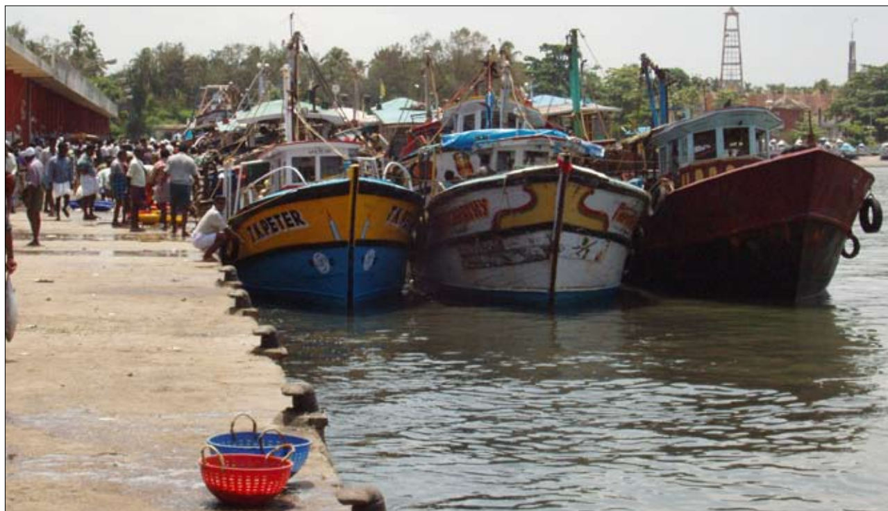
Trawlers at Neendakara fishing harbour, Kerala, India. Small-scale fishing people in the North, of course, enjoy the same human rights as their brothers and sisters in the global South, and they frequently refer to these rights as they criticize the government