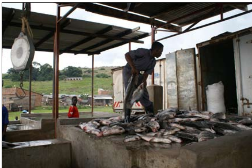
Sorting a catch of Nile perch. The credit is generally provided by fish agents, who provide credit to boatowners in exchange for a reliable and long-term supply of Nile perch