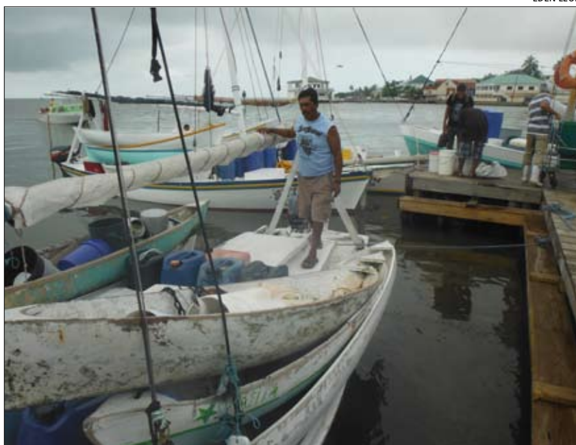
Sail boats docked at a fishing cooperative in Belize. The fishers want management that is fair, equitable, transparent and reliable, which includes meaningful community consultations