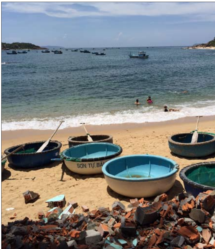
Small-scale fisheries in the small island of Quy Nhon City, Binh Dinh province, Vietnam, where fisher communities work collaboratively with the government to manage the resource

issues of recognized community groups and fishing rights in the protection and management of aquatic resources. The MPA regulations are being revised to include: (i) the management structure of an MPA; (ii) the co-ordination mechanism; and (iii) sustainable financing, including tourism fees in MPAs. Besides, there will be a focus as well on how to ensure biodiversity protection in the defined core and buffer zones of the MPAs.