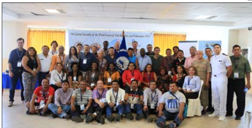
In January 2017, the 31 members of the WFF during the General Assembly in Salinas, Ecuador, discussed the strategies that could amplify the voice of small-scale fisher communities

The Africa Workshop also sought the implementation of the Voluntary Guidelines for the Responsible Governance of Tenure of Land, Fisheries and Forests in the Context