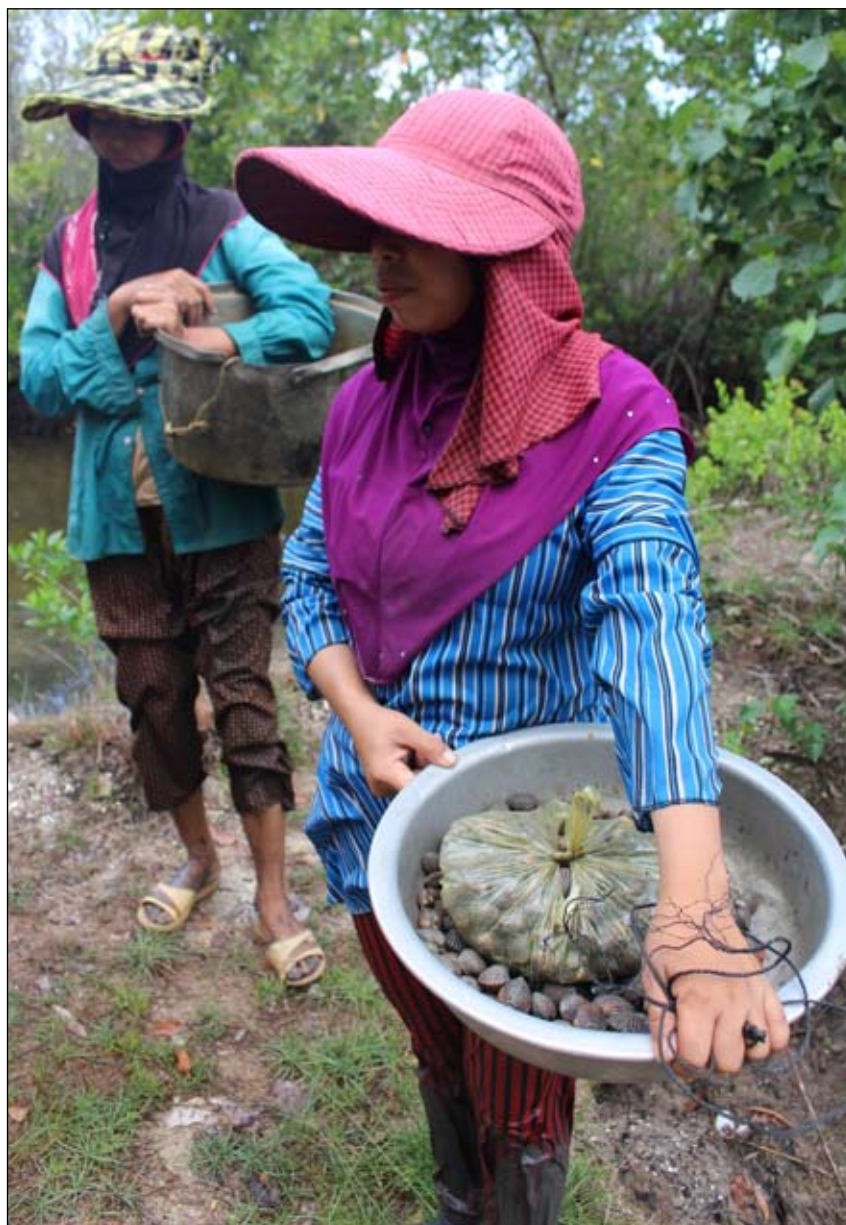
Villagers with blood cockles collected from the sea. Preynub's success shows that empowered local communities can protect their resources and property

Facilities, in collaboration with the Fisheries Administration, supports Preynub's efforts to reduce deforestation and forest degradation. The programme enhances the capacity of local communities and authorities to address forest encroachment through awareness raising, patrolling activities, reporting and documentation. In addition, new and alternative livelihood opportunities such as ecotourism provide an incentive for communities to protect resources.