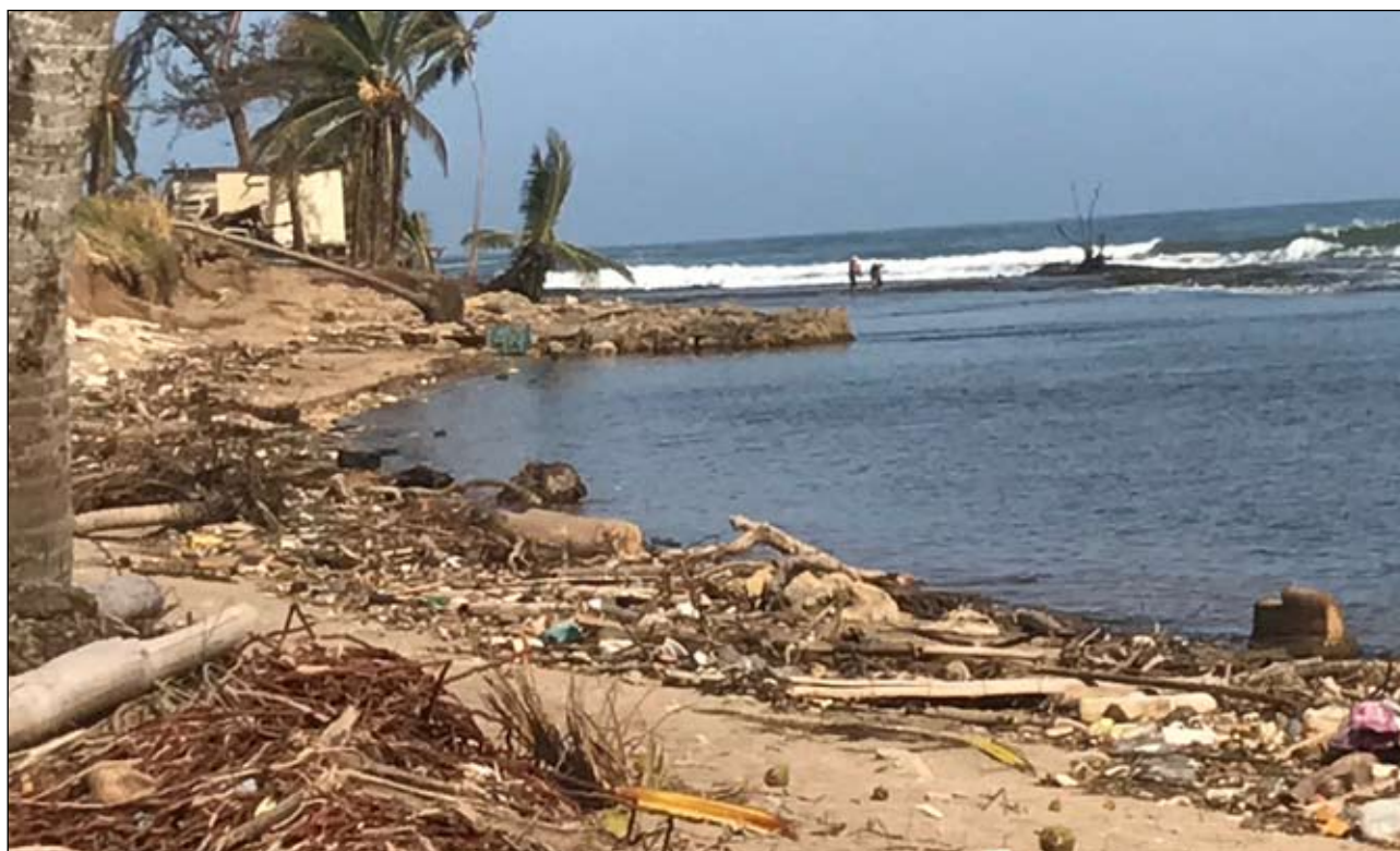
Shores have become inaccessible at Civico, Puerto Rico. With the municipality authorities proving ineffectual in clearing the debris left behind by the hurricane, fishermen have been unable to fish from shores