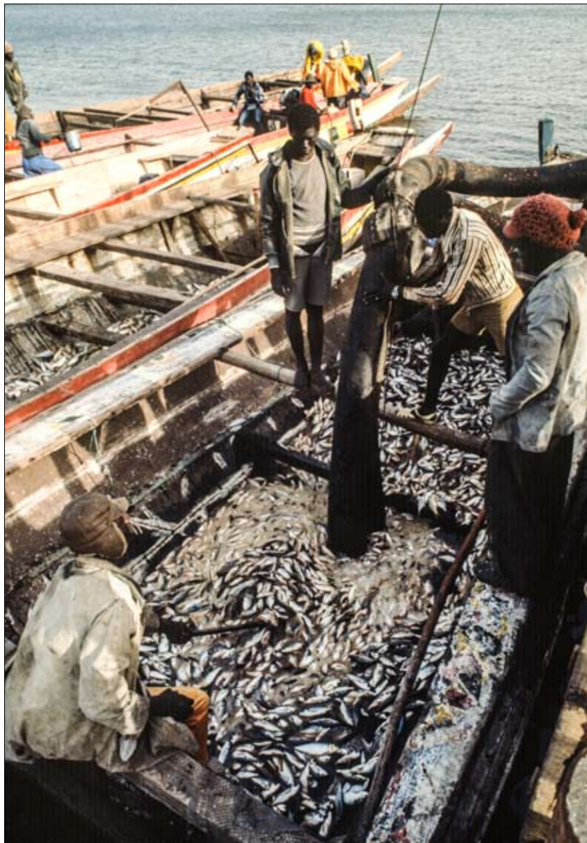
The catch of sardinella is being sucked up by pump at the unloading pier at Djifer, Senegal. Nowadays, fishmeal factories are using an increasing amount of fresh fish, sardinella

the expansion of the production of fishmeal is a threat to regional food security.