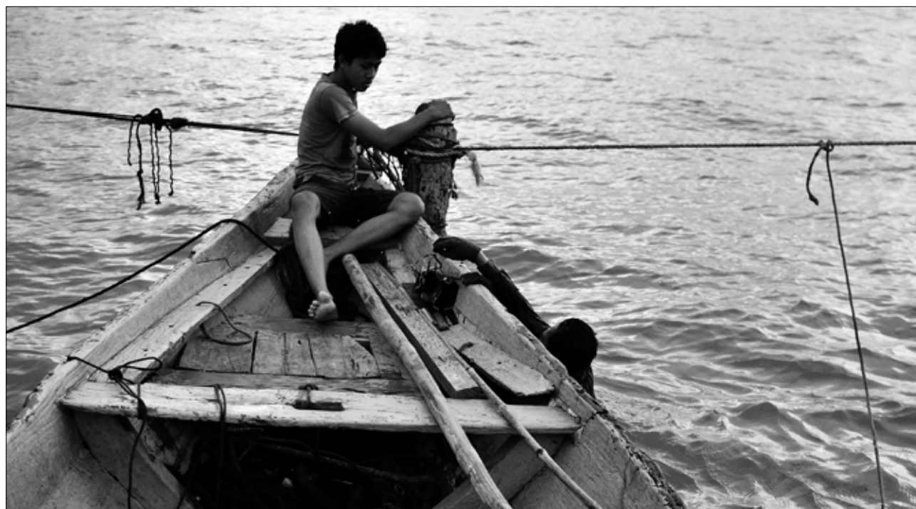
Father and son is placing traditional static fishing gear (locally called as pasang , tadah arus and pertorosan smiliar to stow nets) at Surabaya, East Java Province, Indonesia