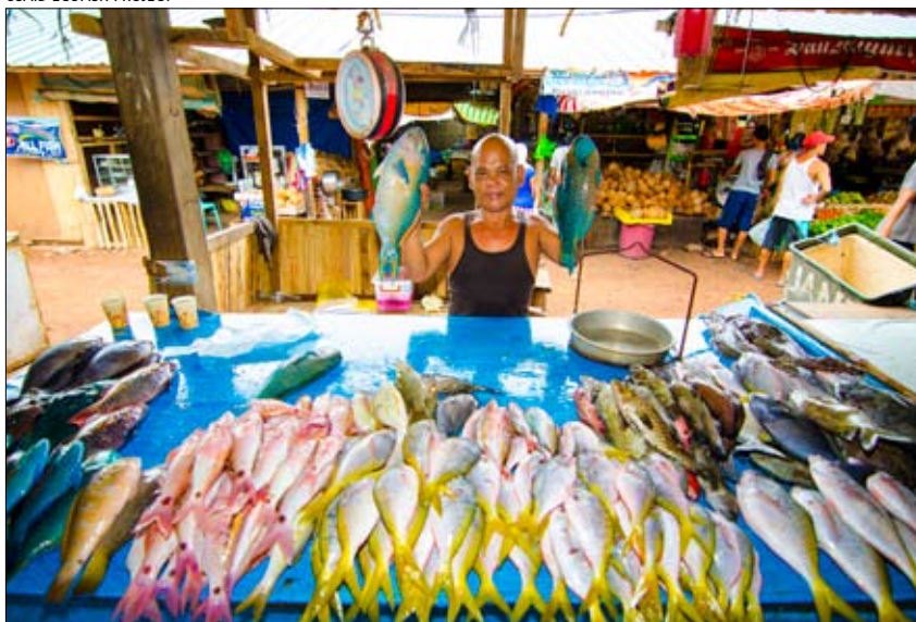
Selling of reef fish in Coron, Palawan, Philippines. Tenure systems are facing increasing stress from booming markets, growing consumption and population growth