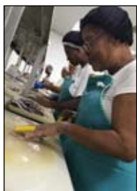
Fisherwomen boning and filleting flying fish, Bridgetown, Barbados