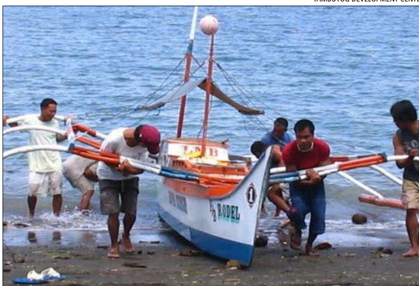
Fishers in Sarangani Province in Mindanao, Philippines. The municipal fisheries production system can be described as highly fragmented, with average catches of 5 kg per fishing trip

Municipal fisherfolk are generally characterized by low-income households. Many of them have only high-school education. Many lack land-based assets and do not have security of tenure of their settlement areas, situated mostly within the nearshore areas. Most fishing households have poor access to water, health, education, housing, credit, and other welfare services. Given this situation, many fishing households are dependent on loan