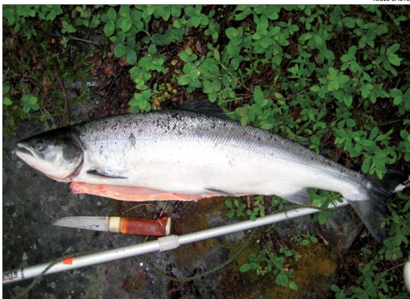
A salmon caught more than 200 km from the river mouth. Salmon fishing is a fundamental part of Sámi culture on both sides of the Finland-Norway border