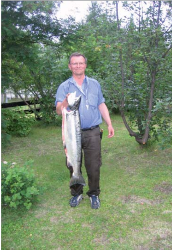
Kjell Saeter, the mayor of Karasjok, Norway. Laws have ensured that fishing is not hindered by private land claims